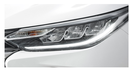
LED Headlamps and Daytime Running Lights